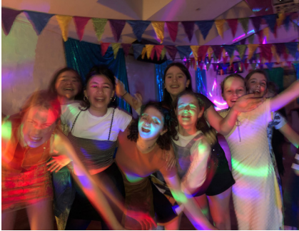
Don't stop me now!

The Disco was wild as ever this year, with a sink hole reappearing in the roof and all the Tinies coming back in their best party outfits. Elva flew back in a UFO with a dozen flying rabbits who all danced like crazy.