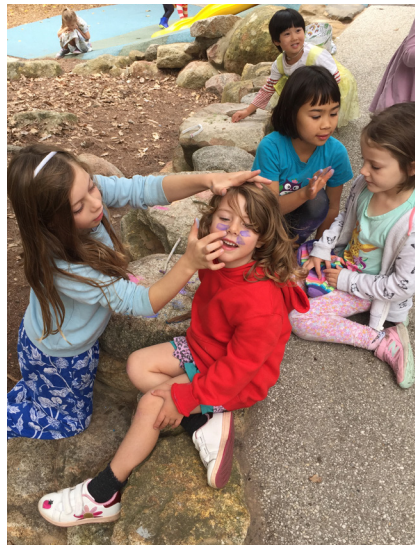
Chalking them up