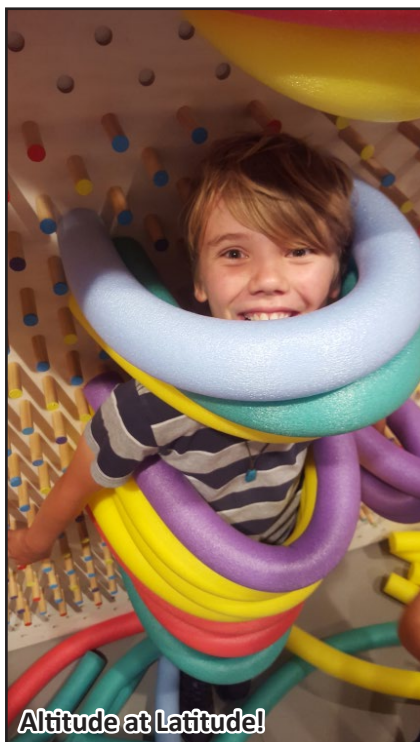
Altitude at Latitude!

children, including a possum tail, a mouse, and a spider. Thanks also to Wayne and some of the children for digging a hole for a sheep that died.