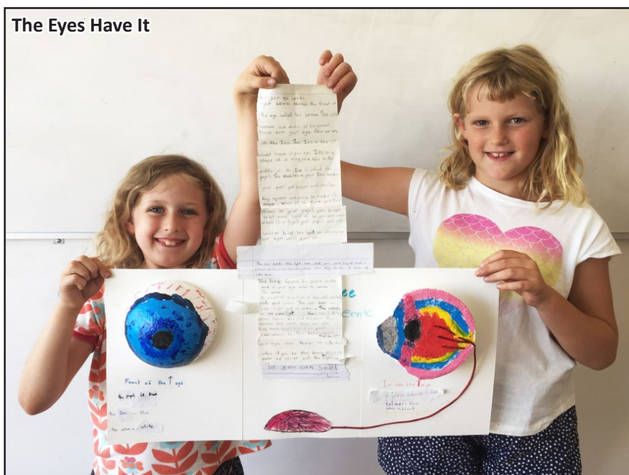
The Eyes Have It

This term, the scientists at both campuses looked at how the eye works. We turned the world upside down and back-to-front, pondered why pirates wear patches, and produced pieces of art on the parts of the eye.