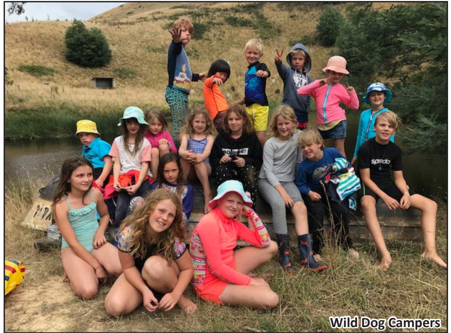
Wild Dog Campers

This term our Tribe outings on Fridays have taken us by tram to the Fitzroy Gardens for tree climbing, running, and wandering through stunning flower displays; by bus to The Royal Children's Hospital playground for water play, slides and great climbing; and by foot along the Merri Creek to Ceres for exploration, and running and hiding amongst the maze of vegetable plots! It's always good to get outside and unwind. It has been especially enjoyable to see the attention and generosity from the older children towards the younger ones. At the start of the year, these outings are a great opportunity for buddies to