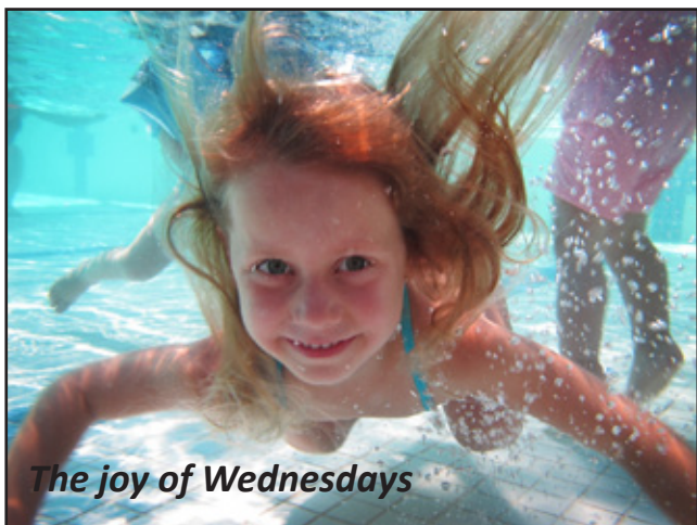
The joy of Wednesdays