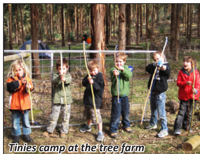
Tinies camp at the tree farm