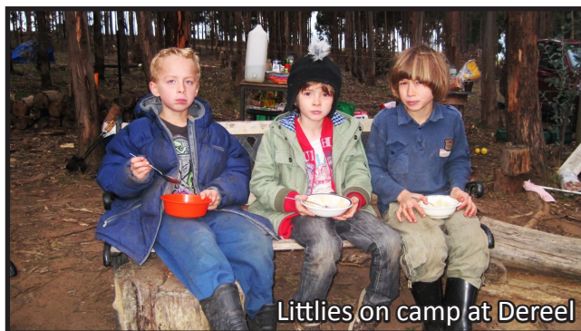
Littlies on camp at Dereel

A camp report from Nettie: Unlike the tempest unleashed on campers last year, the weather this time was tranquil and benign – always a good start to a camp. The new cubby