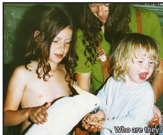
Who are they?

Can you recognise these three people? (Clue: taken in the late 1970's).